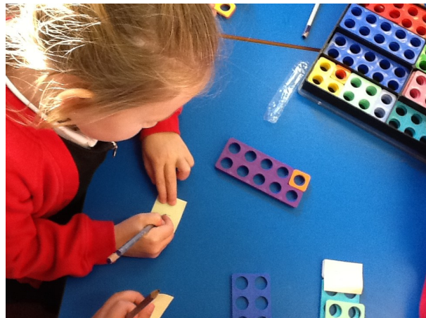
Numicon and number tasks