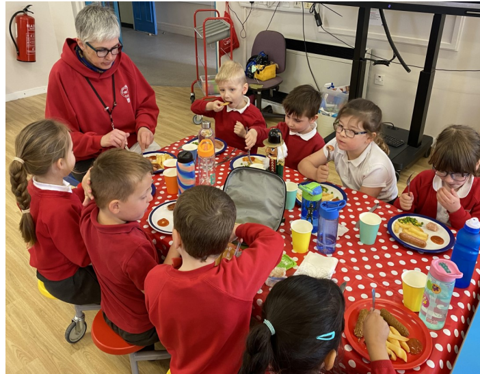
Lunch on Table of the Week

We encourage a positive social interaction at lunch times, staff eat with the children and promote good table manners as well as encouraging children to try new foods. Children have the choice of two lunch options each day which are chosen in advance.